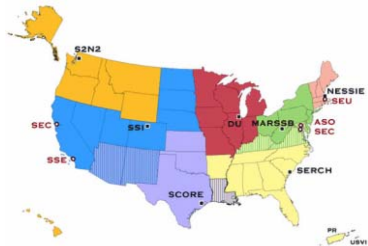
Figure 1. MARSSB serves the Mid-Atlantic Region

As you can see from the map provided in Figure 1, seven different broker/facilitator programs serve the United States. The Mid-Atlantic Region Space Science Broker (MARSSB) serves Delaware, New York, New Jersey, Ohio, Pennsylvania, West Virginia, and shares Kentucky, Maryland, Virginia, and Washington, DC with the South-eastern Regional Clearinghouse (SERCH) broker program.