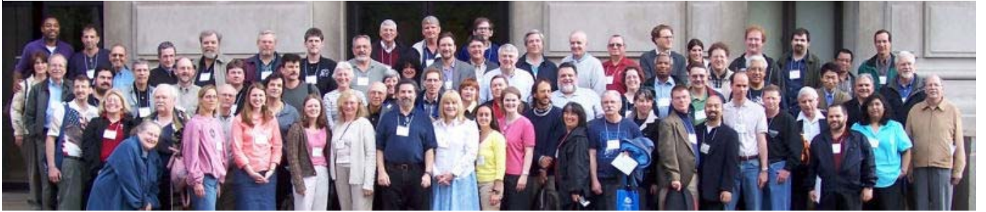
The delegates gather in front of the Franklin Institute.