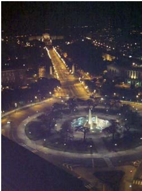
A view of Logan Square from the Taurus Incident