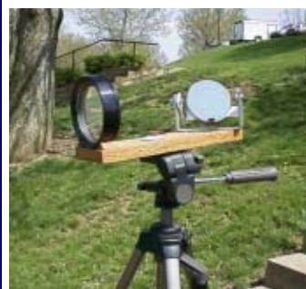
Figure 2. Image from Sun-Earth Day 2004 activities offered by Steve Mitch at the Oglebay Resort Planetarium and the Environmental Education Center

The Sun Earth Connection Educational Forum is planning another multi-disciplinary experience Sun-Earth Day for next year. The event is called Sun-Earth Day 2006 In a Different Light . We will be going live for the total Solar Eclipse somewhere along the path of totality—possibly Turkey. The teacher packets will probably be mailed in December. If you want to participate in advance planning and receive periodic updates about this event, send an e-mail to Elaine Lewis at lewis@mail630.gsfc.nasa.gov . The website will go live by September 1st. You can view the teaser page now on http://sunearthday.nasa.gov . The date for next year's Sun-Earth Day activity is March 29th, 2006.